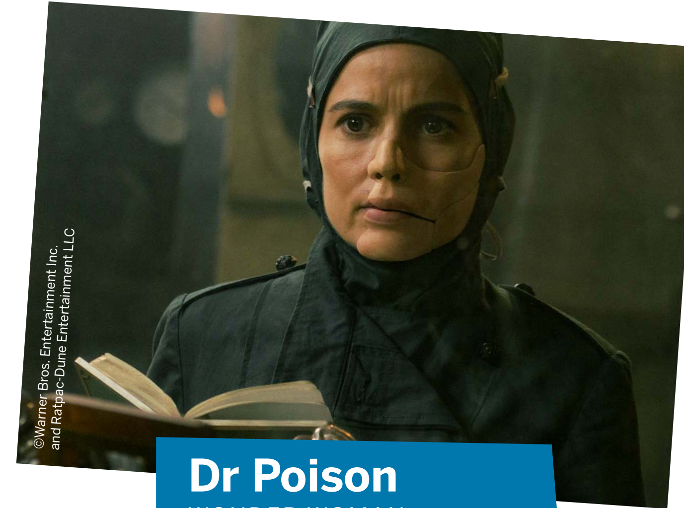
Dr Poison WONDER WOMAN