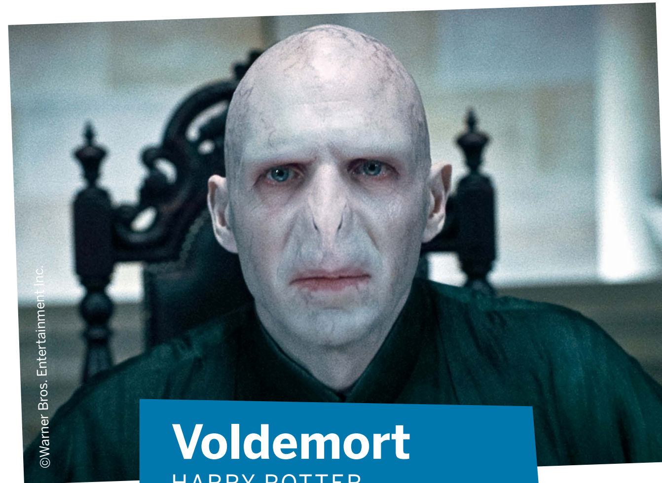
Voldemort HARRY POTTER