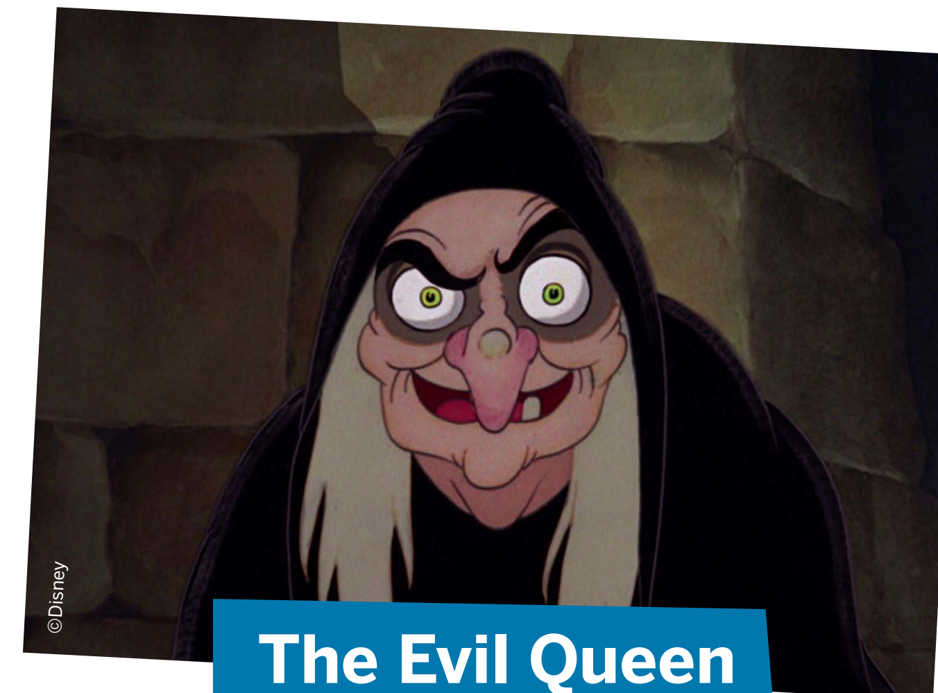
The Evil Queen SNOW WHITE